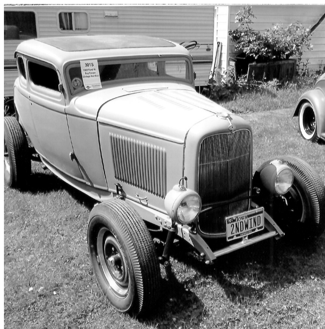
This all-steel 1932 Ford five-window hi-boy coupe powered by a Chevy 350-cid V-8 sold for $34,000.