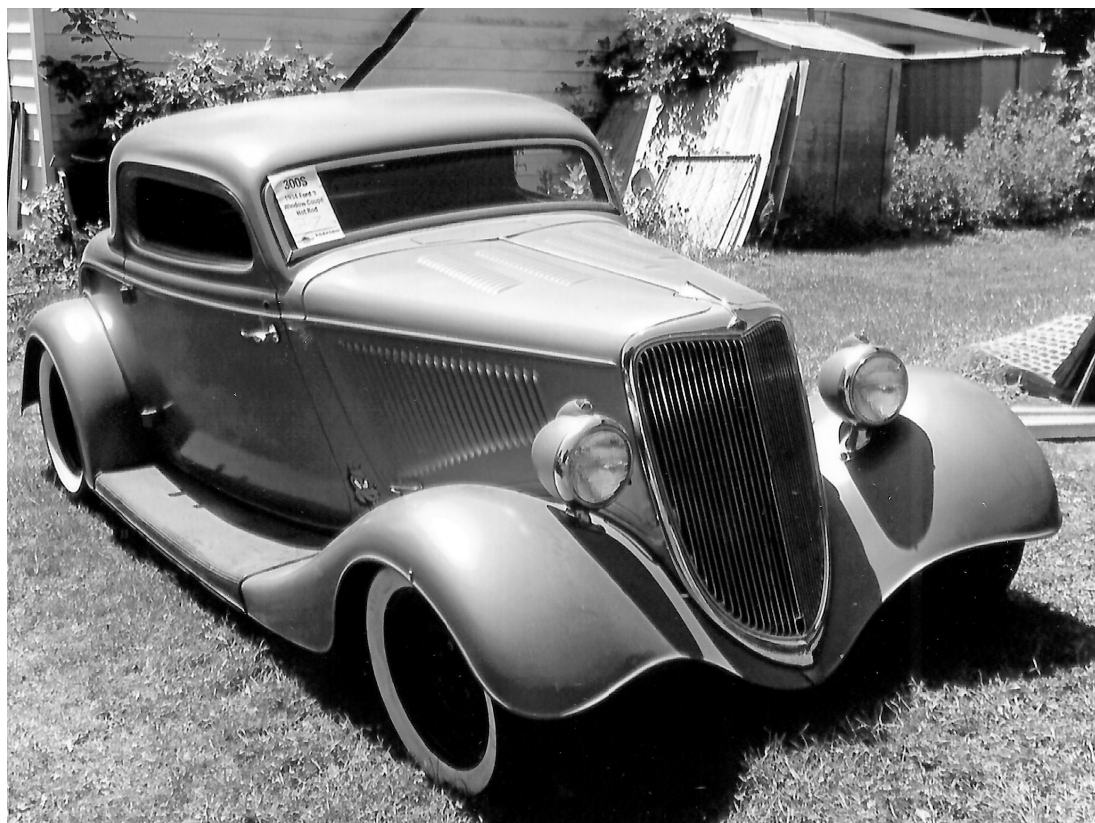
This all-steel 1934 Ford three-window coupe powered by a Chevy 454-cid V-8 sold for $65,000 at the Slaymaker Collection sale in Fostoria, Iowa, presented by VanDerBrink Auctions.