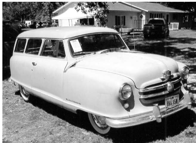
One of only nine produced in its debut year of 1951, this Nash Rambler Deliveryman two-door station wagon sold for $11,250.

While a complete 1953 Cadillac Series 62 hardtop in condition #5 that sold for $2,400 was a noteworthy buy, a more interesting purchase from a history standpoint may have been overlooked in all the hot rod hoopla. Parked off by itself was a 1951 Nash Rambler Deliveryman two-door station wagon in #4 condition. The single-seat commercial package carrier is one of only nine produced in '51, its debut year. It sold for $11,250.