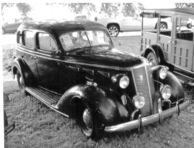
This 1936 De Soto Airstream touring sedan sold for $9,250.