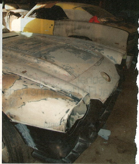
> Each barn holds a different treasure. This unit included this '58 Corvette and a '69 Super Sport Camaro.

"I have a lot of projects going on at the same time ... but when I take a car apart, I know where all the parts are and how it goes back together."—Rob Carter