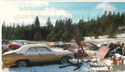
> There are more than 30 Chevilles currently on the property surrounded by an assortment of '55s, Novas, and Camaros.