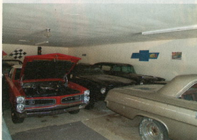
> This '66 GTO and a '67 Chevelle (with a 572-cid GM crate engine) were traded for a '65 Corvette 396/425hp coupe. Note the '62 409/409 Impala and '57 Chevrolet two-door post in the background.