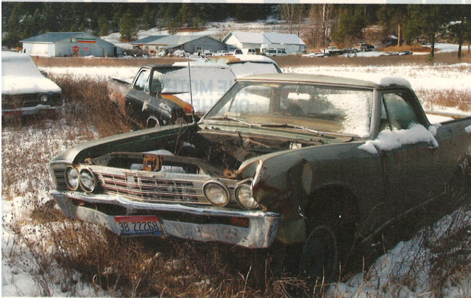
> Rob's backyard offers up a wide variety of different collector cars ready for restoration. The number of Chevy muscle cars is overwhelming.