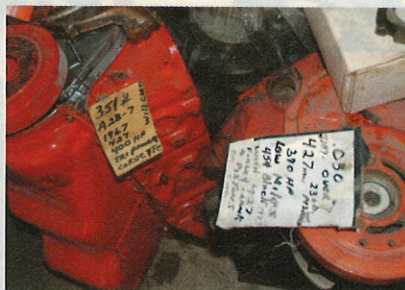
> These are rare 427 blocks ready for restoration. Rob has the cars that go with them.