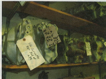
> These rare aluminum intake manifolds are highly prized by collectors.

"I have a lot of projects going on at the same time ... but when I take a car apart, I know where all the parts are and how it goes back together."—Rob Carter