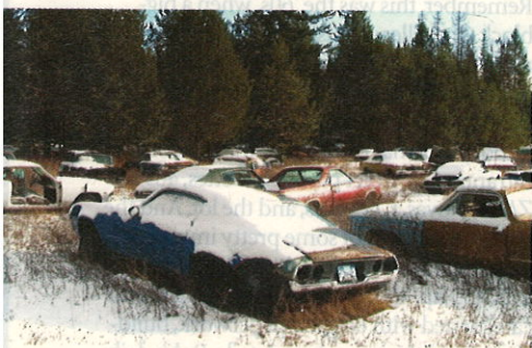
> Here are some more backyard finds. Most of the Camaros are Z/28s.