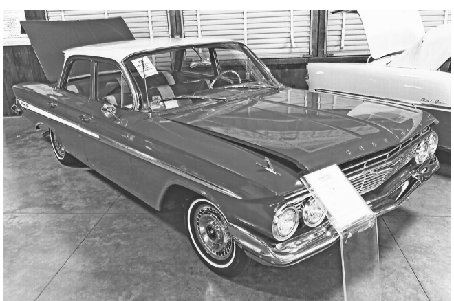
■ A nice factory-ordered "sleeper" 1961 Chevy Impala four-door sedan with Power Pack 283-cid V-8 and three-speed manual transmission sold for $20,500.