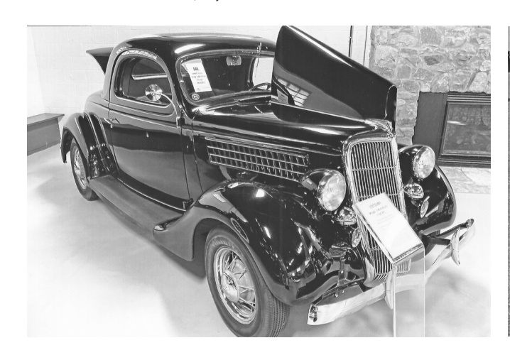
■ This 1935 Ford 48 three-window coupe got plenty of attention from bidders. It eventually sold for $42,000.