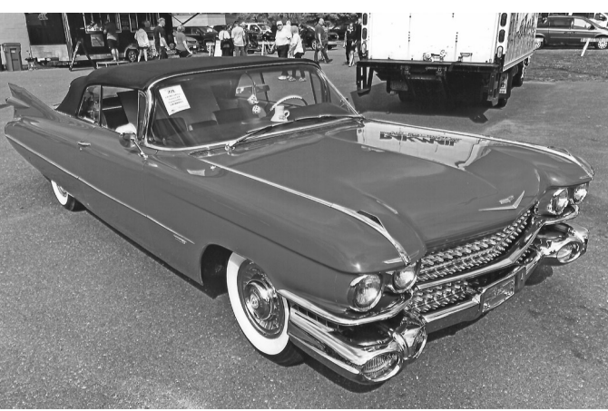
■ This "fin-tabulous" red and black 1959 Cadillac Series 62 convertible topped out at $116,000.