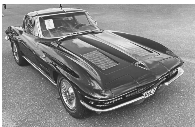
■ A fuel-injected 1963 Chevy Corvette split-window coupe was one of the stars of the show. It changed hands for $285,000.