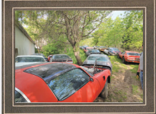
Incredible Barn Finds.. Coyote Johnson Collection