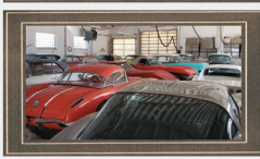
The Amazing Bob Regehr Collection Barn Finds