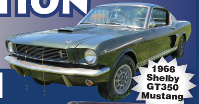
1966 Shelby GT350 Mustang